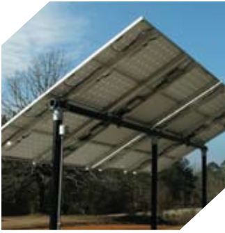
Underside of multi-pole mount